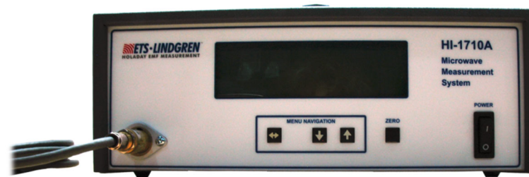
HI-1710A Front Panel