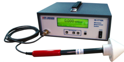
HI-1710A with HI-2623 Microwave Oven Probe

The ETS-Lindgren HI-1710A Microwave Measurement System combines the proven and reliable diode sensing technology of the ETS-Lindgren Microwave Survey Meters with the digital processing techniques developed for automatic oven scanning.