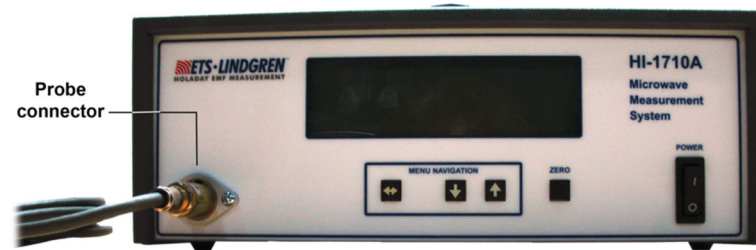
HI-1710A Front Panel