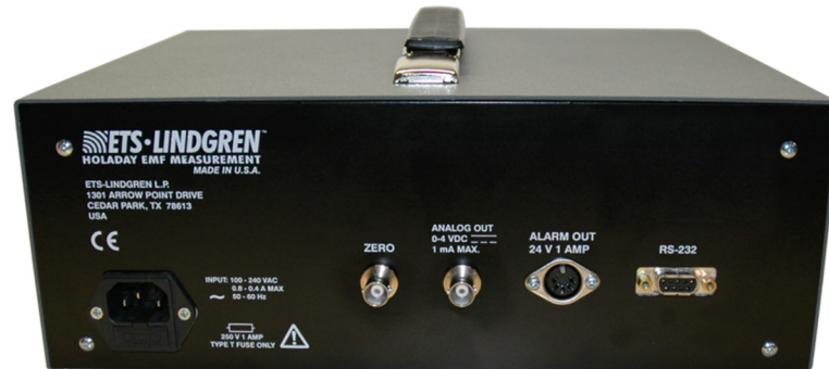
HI-1710A Back Panel